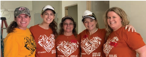
From top to bottom: A group of female volunteers smile in the home they’re helping to build; Habitat Chesapeake celebrates the opening of the Columbia ReStore.

Our mission of bringing people together won’t stop here. With 15 homes under active construction and 20+ more in the pipeline, we continue to welcome every person who works tirelessly to bring this dream to fruition. Whether it’s the volunteers on our construction sites who lend a helping hand, partner families working to fulfill their dream of homeownership, or HabiCorps trainees aspiring toward a career in construction trades, we’re proud to be highlighting their stories along the way.