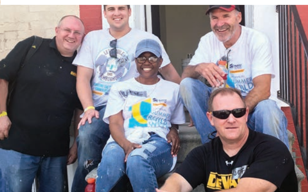
Above from top to bottom: Wells Fargo sponsors a 2022 Women Build day at Eager Street in East Baltimore; Volunteers can build skills in painting, drywall, carpentry, and more; A group of volunteers from Summer Build gathered on the steps of a Habitat home.

Our mission of bringing people together can be found throughout our work, but this past Spring, the spotlight was on our Workforce Development Program, HabiCorps. In March, HabiCorps hosted its first-ever HabiCorps reunion , bringing together 5 cohorts of trainees and instructors! Among the crash of bowling pins, alumni caught up and reminisced about their time in the program and where their futures were headed.